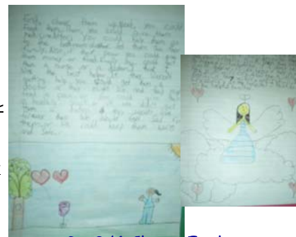
Gr. 3/4 Class: Explanatory Writing: How can people help the poor and sick?