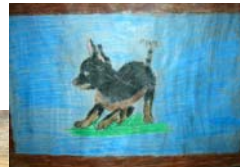
Gr. 5/6 Class Art Crayon Resist

We would like to send out a GREAT BIG THANK YOU! To President's Choice Children's Charity for their generous work and donation to our breakfast program through their Breakfast for Learning Program. It has provided us extra money this year so we can ensure our continued breakfast club and even expand it! You have our warmest thanks!! ☺