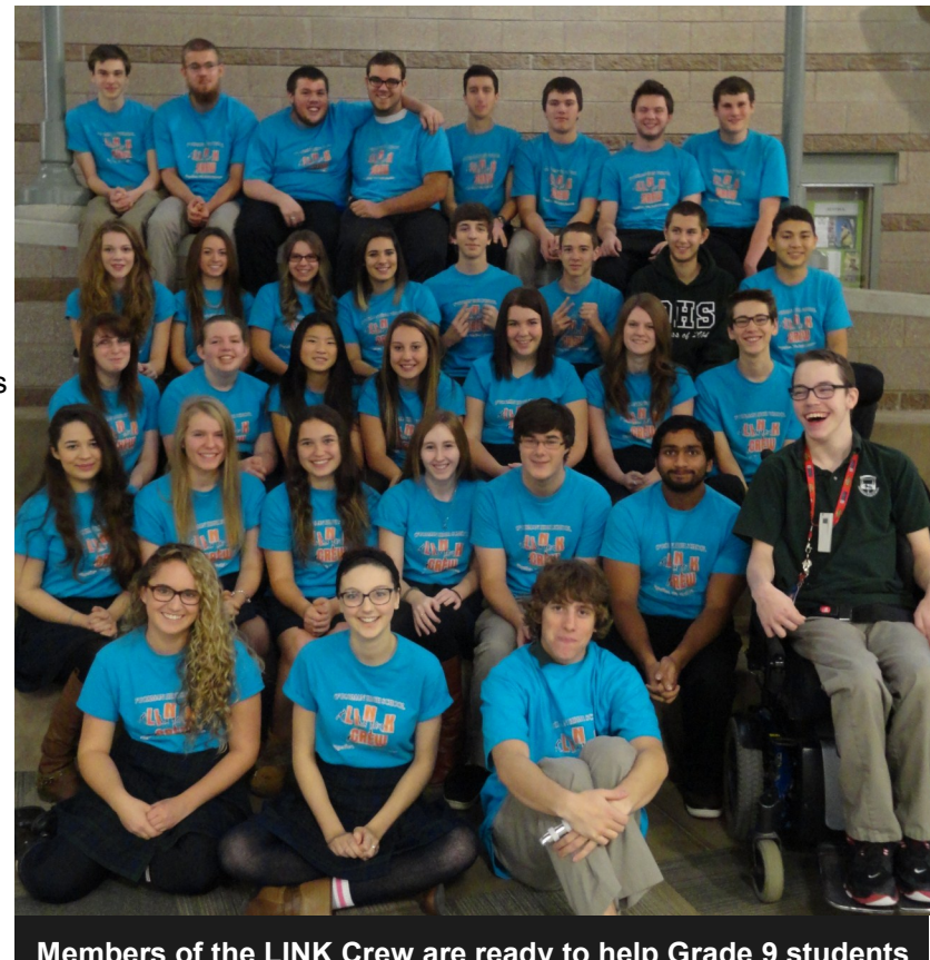
Members of the LINK Crew are ready to help Grade 9 students study for their exams.