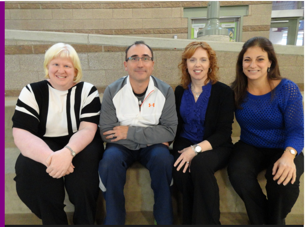
Department Heads offer ongoing leadership and support to fellow staff members.