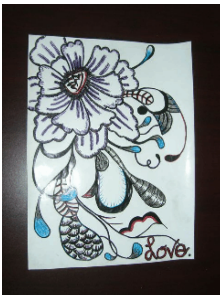
by: Britney Bujold