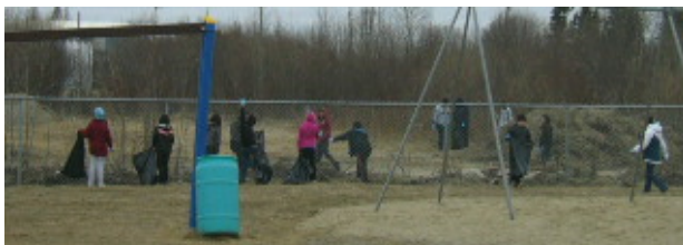
Students cleaning up around the school during Earth Day, April 22nd.

You are invited to attend Mass on Sunday, May 2nd with your children at 11:00 a.m.